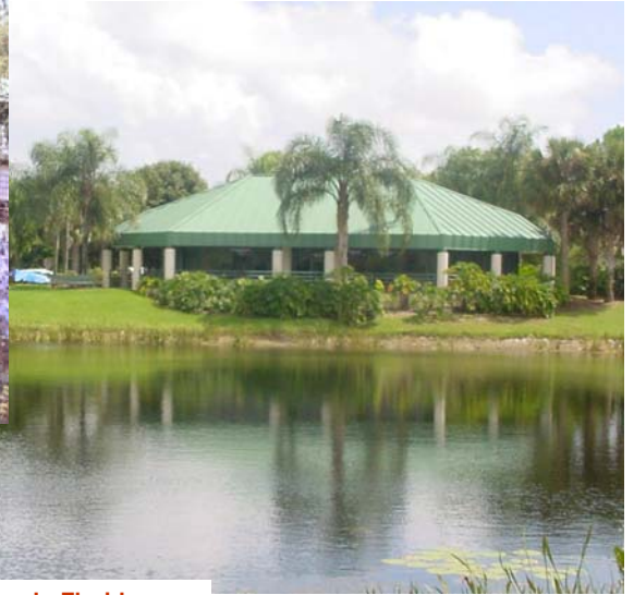
West Palm Beach, Florida